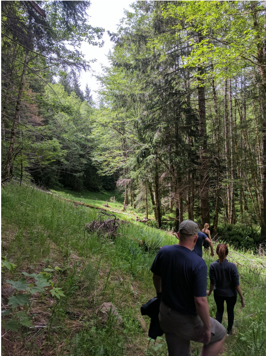
Recontoured road, Olympic National Forest - Skokomish Watershed, 2017.

implement the most effective decommissioning treatments to maximize restoring ecological integrity to the area. These actions will ensure the Forest Service finally achieves its goal to establish a truly sustainable forest road system.