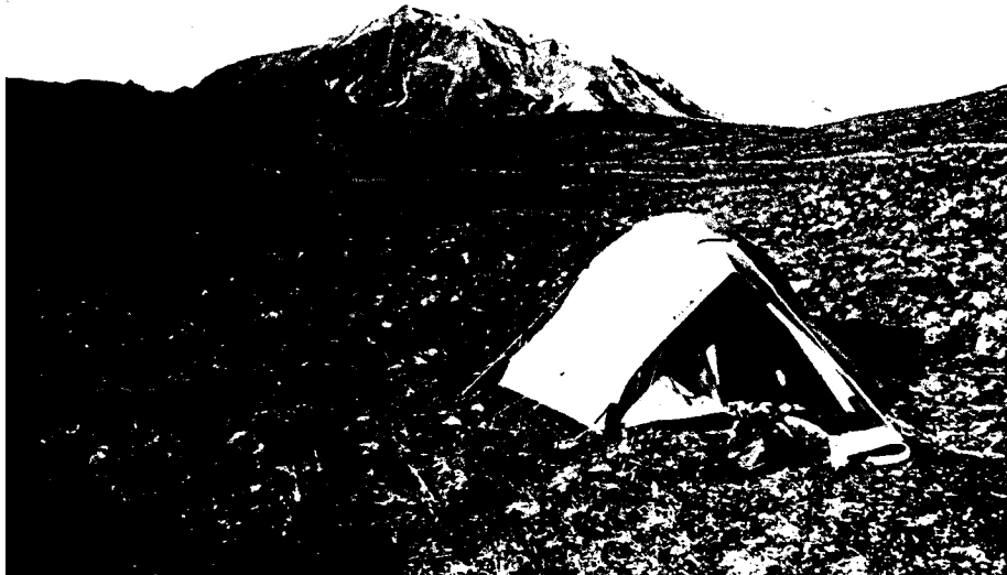
Figure 2- Campsite impacts and appropriate low-impact practices. (A) In remote locations, it is most appropriate to camp on a previously unused site (practice 24). It is also important to select a durable site (practice 27) to spread out tents and activities (practice 34) to keep lengths of stay short (practice 35) and to camouflage any disturbance (practice 36). (B) In popular locations, it is most appropriate to camp on a well-impacted site (practice 23). It is also important to select a site that is large enough to accommodate your party (practice 26) to select a concealed campsite (practice 28) to confine tents and activities to already impacted areas (practice 32) and to leave the site clean and attractive for the next party (practice 33). (C) tightly impacted sites, like this one, should not be used (practice 25). If the campfire ring is dismantled and the wood and rocks are scattered, this site should recover rapidly. With continued use, however, it will soon deteriorate into a well-impacted campsite.