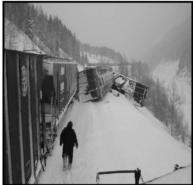
Figure 3. 2004 BNSF freight train derailment caused by a natural avalanche initiated in "Second Slide" avalanche path.

On January 28 th , 2004 at 11:47 AM a dry slab avalanche released in a well established, unprotected, and historically notorious avalanche path named "1163." The resulting avalanche hit an east bound grain train on Main 1 derailing seven (7) empty grain cars from the rail. The resulting derailment displaced the cars, not tipping them over but disabling the train so it could not move. A secondary avalanche released a moderate elevation starting zone of an avalanche prone area now appropriately named "Second Slide" and derailed an additional eight (8) cars ( Figure 3 ).