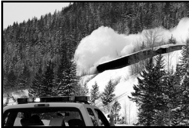
Figure 4. Shed 8 avalanche debris and powder cloud from BNSF Railway explosives operation.

smaller soft slabs in the starting zone of 1163 (SS-AE-R2-D2). There were no results in the starting zones of Shed 7 or Infinity.