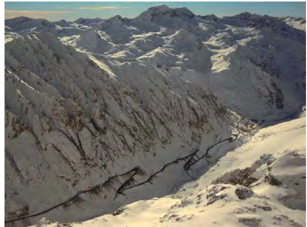
Fig.5 Helicopter bombing mission after snowfall, August 2012.

The largest problem for the winter operation crew is to assess the avalanche risk without been influenced by the mining operators. The mining business is based on the optimal use of operation hour. Therefore closures due to natural hazards are not popular. The winter operation crew remain independent and withstand the external pressure. This is not easy when the mine directors need to operate.