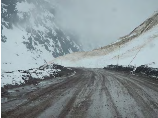
Fig.4. Avalanche deposits interrupting the industrial road, October, 2015. (see Vera, 2016).