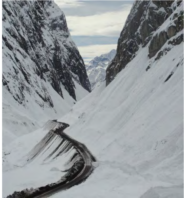
Fig.2. Industrial road after the clearing, August, 2015. The industrial road cross along steep slopes for 10 km.

The winter operation crew publishes a so-called 'risk bulletin' twice a day. The bulletin informs minors of any natural hazard dangers and possible consequences. The bulletin is valid until the next bulletin is published.