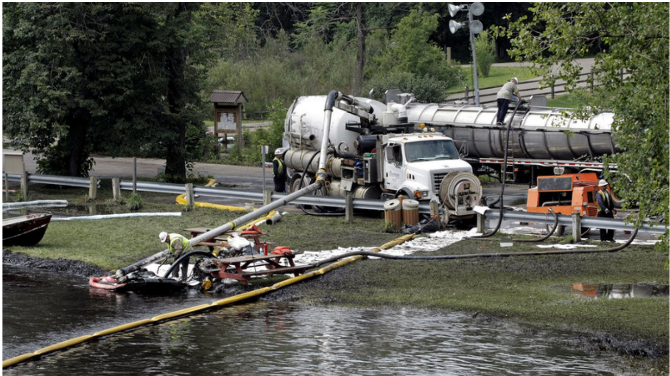
Workers in Battle Creek, Mich., use suction hoses to try to clean up an 800,000-gallon oil spill in the Kalamazoo River in July 2010.