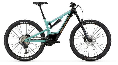
EU Pedelec/Class 1