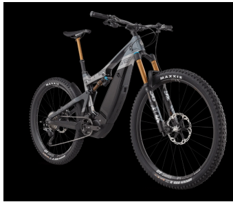
EU Pedelec/Class 1