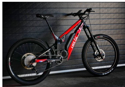
Not a US legal ebike