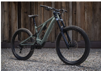
EU Pedelec/Class 1