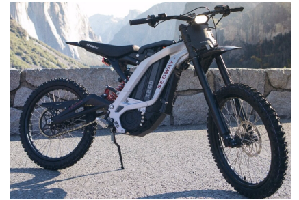
Class 2 or not US legal, depends on the settings.