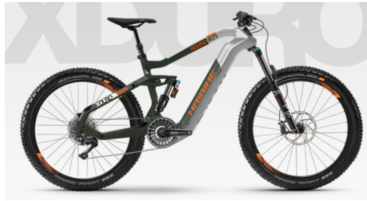
EU Pedelec/Class 1