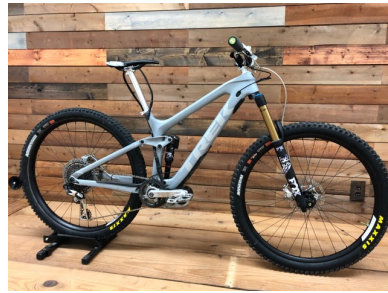
Not a US legal ebike