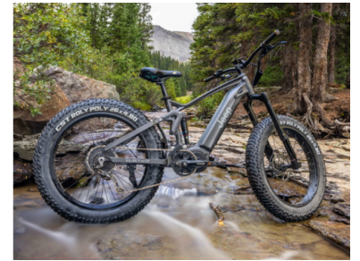
Class 2 or not US legal, depends on the settings.