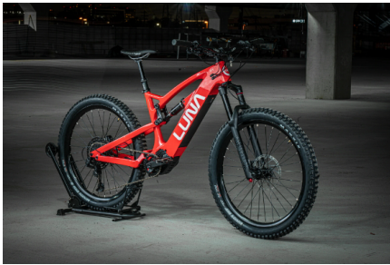
Class 2 or not US legal, depends on the model.

CS Parks Class 3 - 750w, 28 mph cut out, pedal assist only.