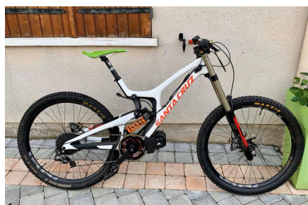
Not a US legal ebike