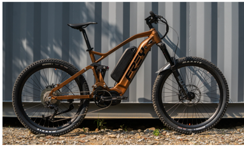
Class 2 or not US legal, depends on the settings.