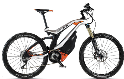
EU Pedelec/Class 1