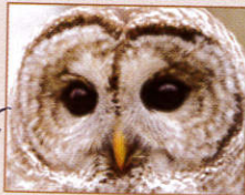
BARRED OWL

the incredible huge structure is unacceptable.