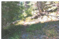
IMG_3699.JPG 132 KB