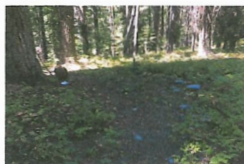
IMG_3723.JPG 198 KB