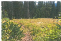
IMG_3671.JPG 136 KB