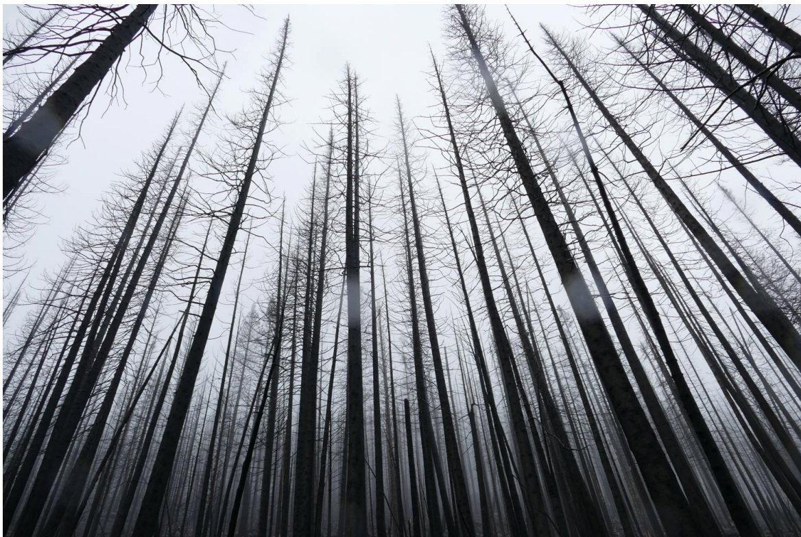
Severely burned forests can look barren, but beetles, birds, and other wildlife begin returning as soon as the flames go out.

Birds were everywhere. Western Tanagers chirruped and Western Wood-Pewees buzzed. A Mountain Bluebird the color of movie-star eyes gleamed from a jet-black spar of larch. A Hermit Thrush sang, and everywhere woodpeckers—Hairy, Downy, American Three-toed, Northern Flicker—rattled, cackled, and whinnied.