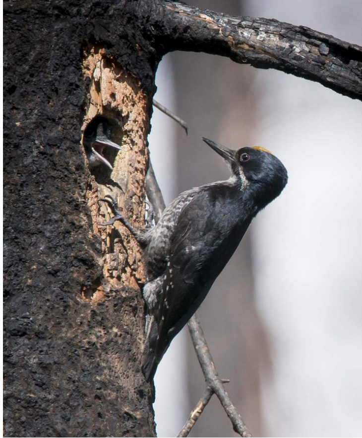
Both the male and the female care for the chicks, which fledge after about 24 days.

Moments later came a scolding, mewling sound, as if a wren was mugging a cat. That's the Black-backed Woodpecker's giveaway call. A glossy, blue-black male flew in carrying a larva as long as his bill, and dipped his head into his nest hole.