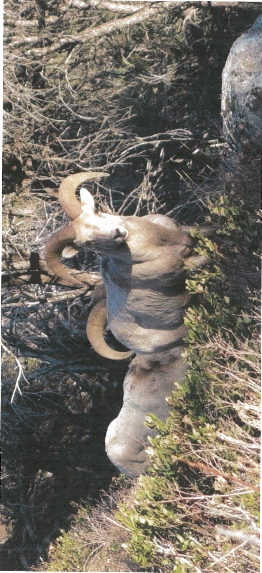
PHOTO TAKEN ON SOUTH SIDE OF PEAKED IN JUNE 2019 IN THE LOCATION OF THE PROPOSED "SOUTH BOULDER CONNECTOR" LIFT