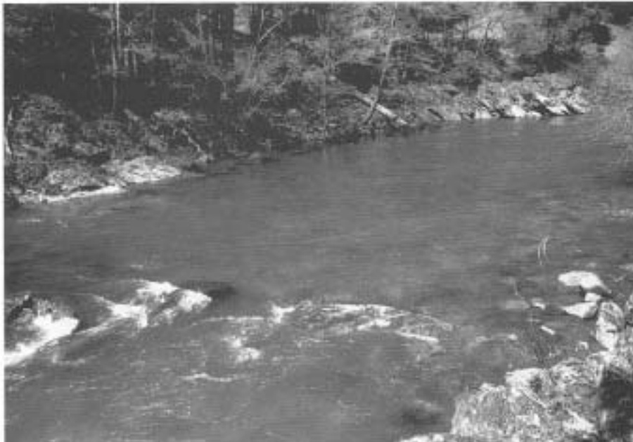
This is the same site in spring of the following year. The log at water's edge in the upper, center-right of this photograph is visible in the upper center of the photo above.