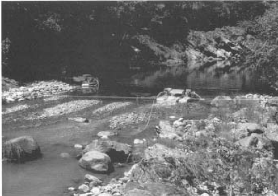
A miner works upstream of these dredges in Butte Creek, California, at a depth of greater than 2 meters.