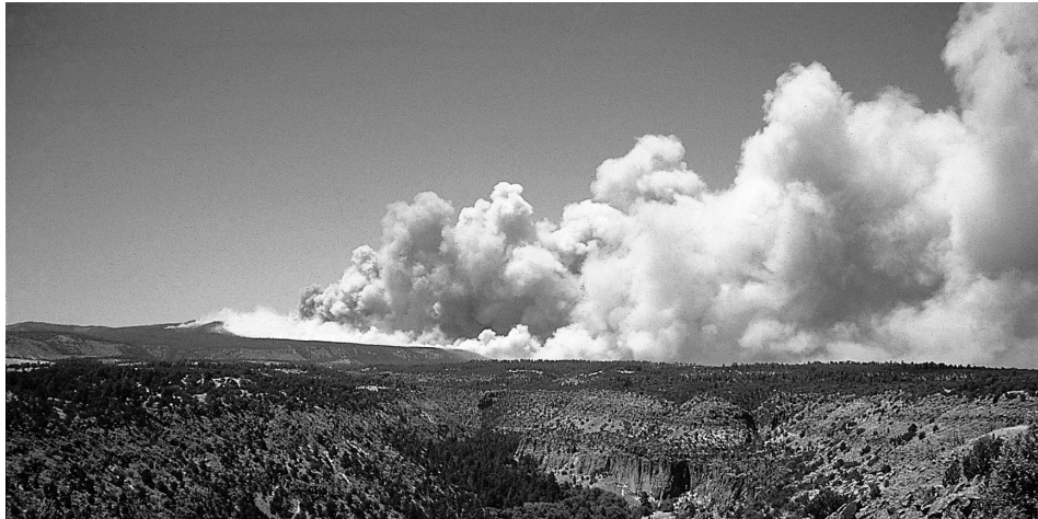
FIG. 2. View looking northwest at the Cerro Grande Fire on the afternoon of 10 May 2000 as it burned toward Los Alamos, New Mexico (USA). Similar large, stand-replacing fires are becoming increasingly common in Southwestern ponderosa pine forests.

scape scales (Cooper 1960, White 1985), with pattern shifts through time within a natural range of variability (Swetnam et al. 1999).