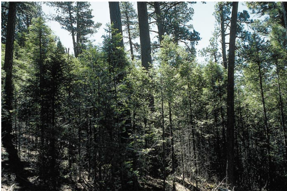
FIG. 1. Ponderosa pine forests of the American Southwest. (Top) Open ponderosa pine forest representing “typical” pre-1900 conditions, with grassy understory and surface fire activity. (Bottom) Altered ponderosa pine stand in need of restoration, showing changes in both stand structure and species composition. The dense midstory of mixed conifer trees provides ladder fuels that favor crown fire development.

port the development and implementation of a diverse range of scientifically viable restoration approaches in these forests that address the critical issues of forest heterogeneity, scientific uncertainty, and effects on wildlife. In addition, we suggest principles for ecologically sound restoration approaches. It is not our intention to emphasize a critique of any particular model, but we do present ecological perspectives on several alternative forest restoration approaches.