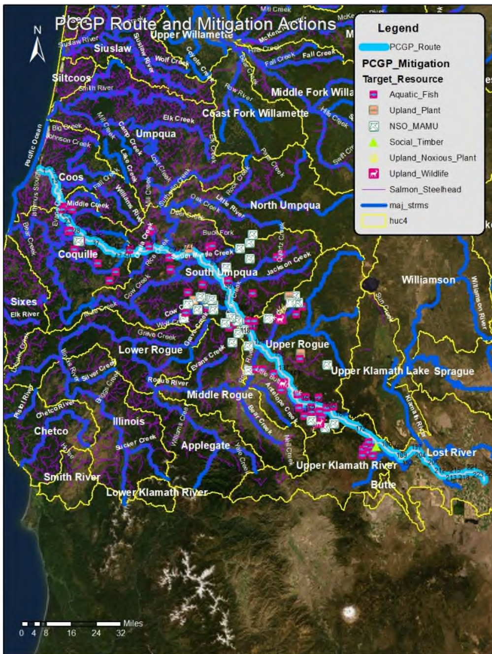
Figure 2. Pacific Connector Gas Pipeline route, HUC 4 delineations and proposed BLM and USFS mitigation projects.