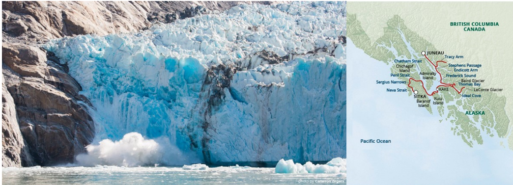
View Map Larger

Itinerary Rates and Dates Ports and Places Land Packages Vessels