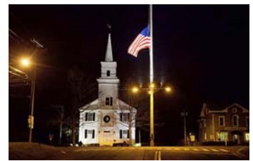
Spending deal ends two-decade freeze on gun safety research