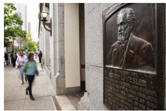
The courthouse will be safer, but what about the rest of downtown Seattle?