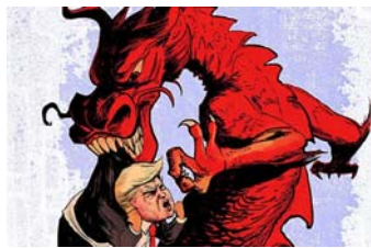
Trump is getting played by China