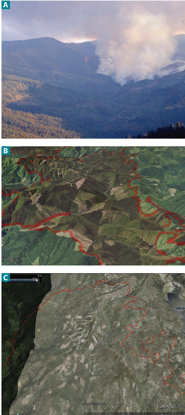
Figure 2 Three views of where fires burned unnaturally severe: (a) Quartz fire 2001, southwest Oregon, burned hottest in cut over lands; (b) Douglas-fire 2013 complex (red border) in southwest Oregon burned hottest in tree plantations; (c) Rim fire 2013 (red border), Stanislaus National Forest, burned hottest in the image center where tree plantations were dominant. Fire severity analysis in preparation.