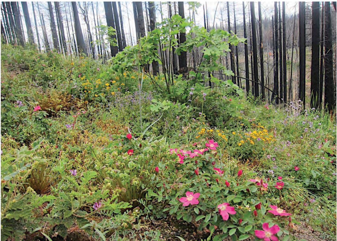
Rim fire 2013, Stanislaus National Forest, D. Bevington

Unfortunately, after quick and often large-scale implementation of biomass energy production in Europe and parts of the U.S., studies are revealing