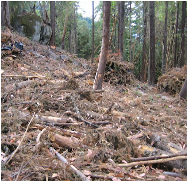
Thinning in the Ashland watershed, southwest Oregon; photo: D. Odion

In this report, we examine two core assumptions about why thinning is advocated in biomass projects, including it: (1) can be used to lower fire intensity and occurrence and therefore carbon emissions compared to wildfires that are increasing; and (2) biomass produced from thinning can be used as a clean, renewable energy in place of fossil fuels.