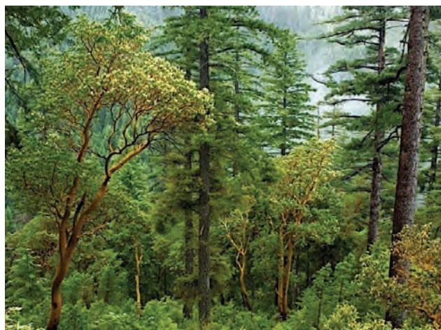
Mixed-evergreen forest, southwest Oregon, Photo: K. Schaffer

models have been criticized because they have had a tendency to over-predict effects of thinning on fire intensity and they lack empirical testing. 21 Relying too much on thinning to reduce fire intensity using these models is creating a false sense of security that fires will burn in low intensity in what are predominately mixed-severity, climate-influenced systems.