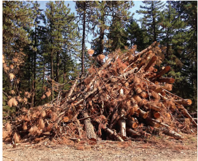
Logging slash near the Greensprings area, southwest Oregon, D. DellaSala

Many municipalities, electric companies, and small energy producers are replacing fossil fuel energy production with biomass energy in response to global concerns about greenhouse gas emissions and the negative impacts of climate change. Biomass is often classified as a “renewable” energy source and therefore receiving of various incentives and credits because when trees and shrubs grow back they are able to sequester the carbon that was emitted during combustion for energy. This abundant energy source is seen as a “win-win” because it is often sourced from forest thinning byproducts with the intention of reducing the risk of wildfire. According to the Western Governor’s Association, 1 10.6 million acres are available for “hazard fuel reduction” yielding 270 million dry tons of biomass.