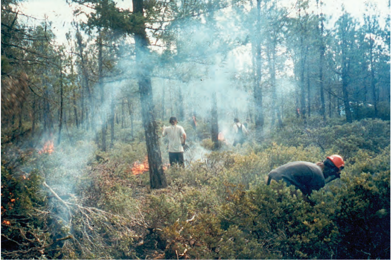
Low-elevation fuel treatment, Lomakatsi Restoration Project, D. DellaSala

models 31 and ground verification of fuel models and carbon assessments (accuracy assessment). Independent verification of assessments should be factored into a project's operating costs, much like carbon offset projects.