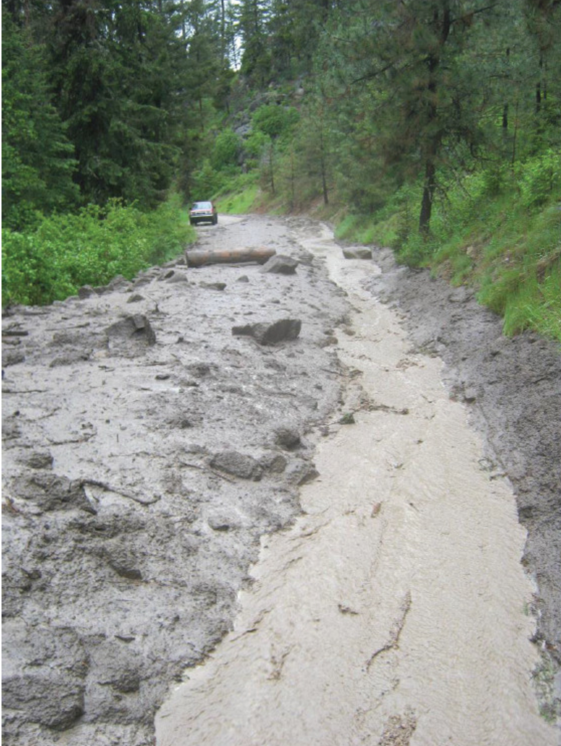
Above, debris flow, Forest Road #969, the Willow Creek Road, a primary haul route for proposed Gold Butterfly timber sale, after a storm event on June 13, 2017. The photo below is of the same area.