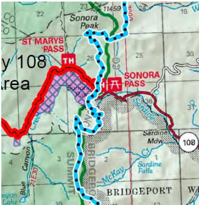
*Alternative 5-Modified Map