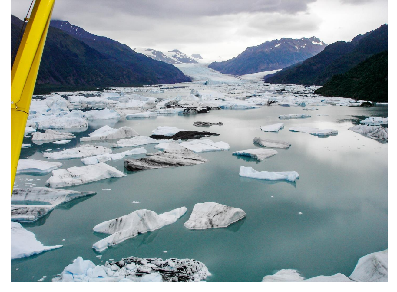
Turnagain Pass 1989: