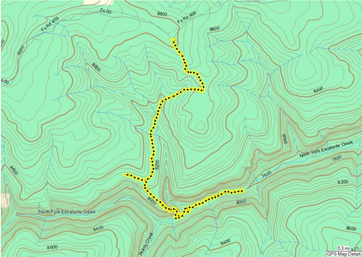
Our track. Note where we missed the unmarked turn to get into the canyon.