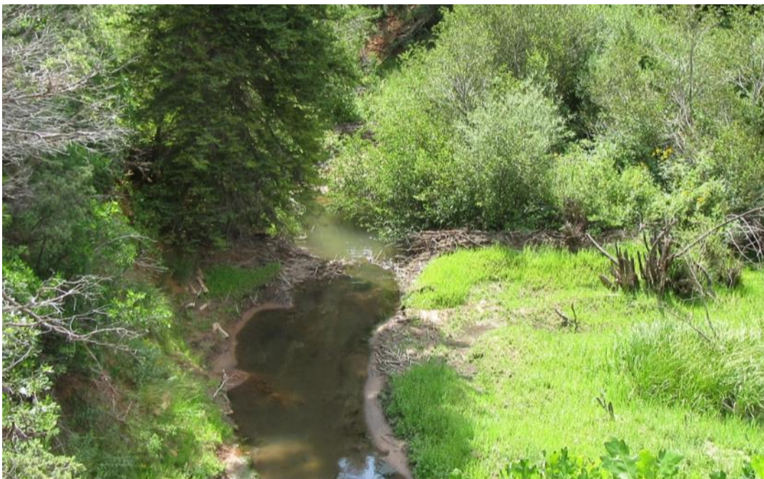
Beaver dam removed at: 711300 4273961