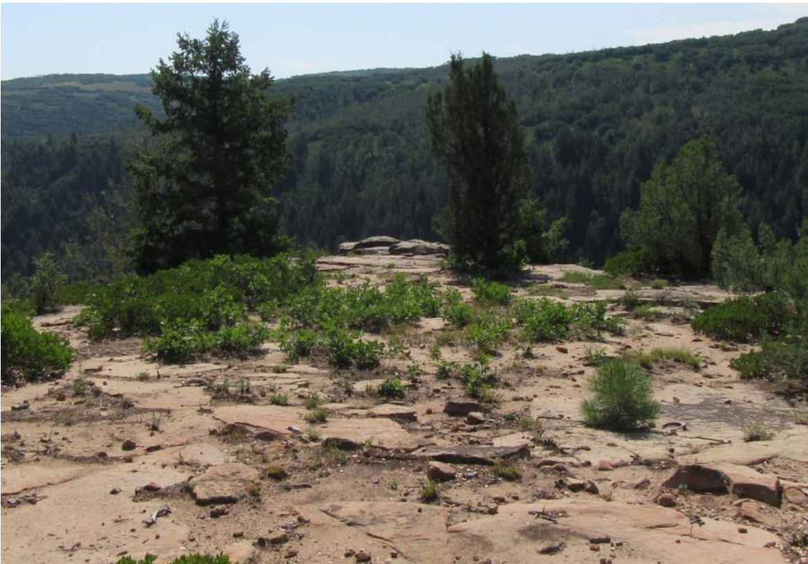
The “end of the world” but the trail goes right on over the end of the rocks.