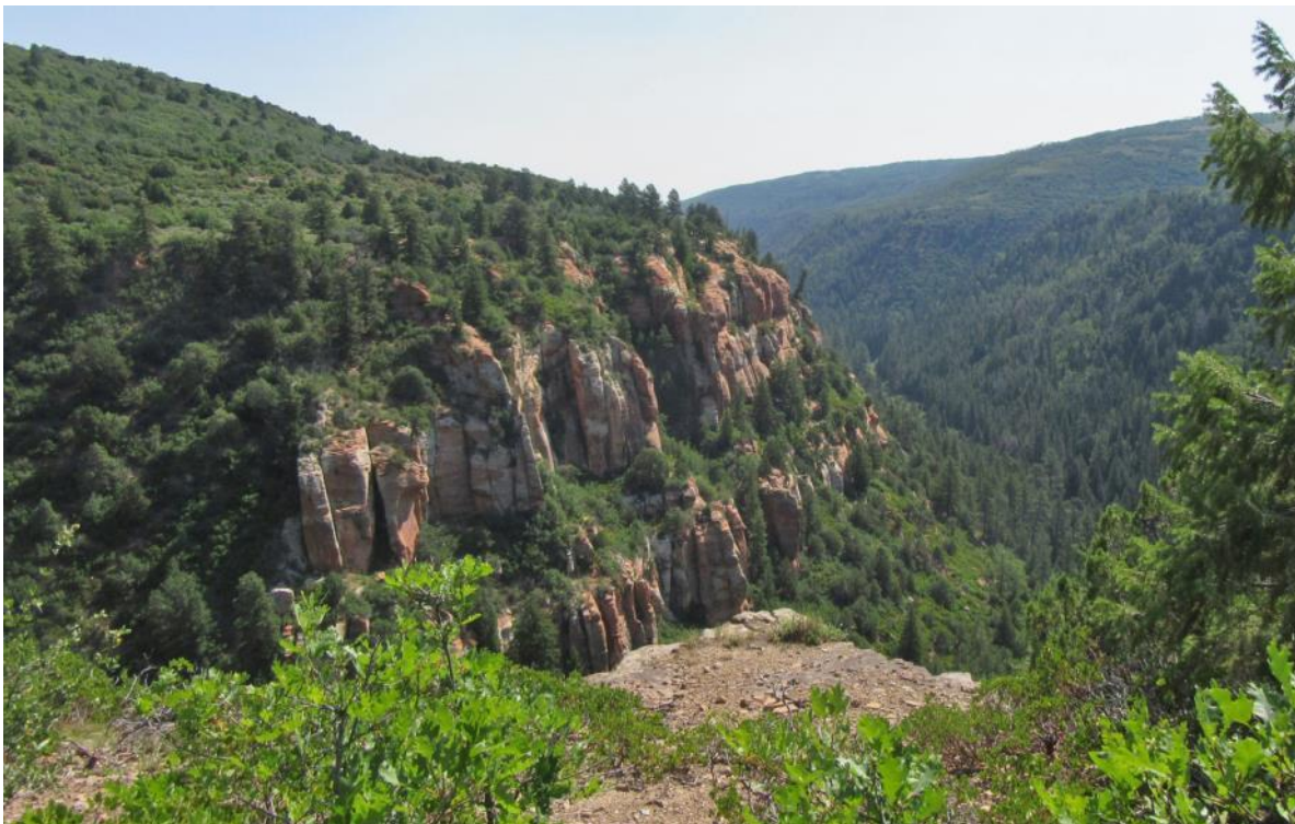
Looking down North Fork Escalante Creek canyon. Part of Escalante Breaks in view.