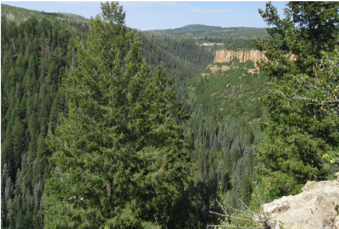
Looking up North Fork Escalante Creek canyon towards Uncompahgre Butte.