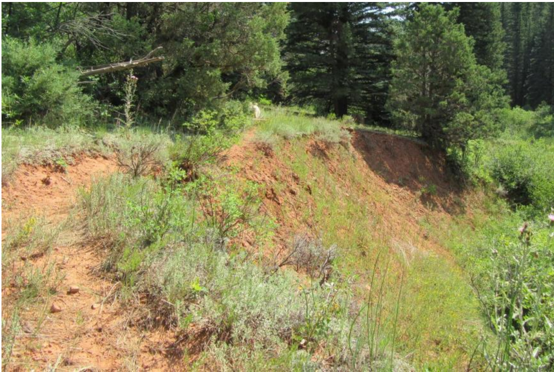
Creek bank collapse almost removed trail. 710803 4273729 dir: east.