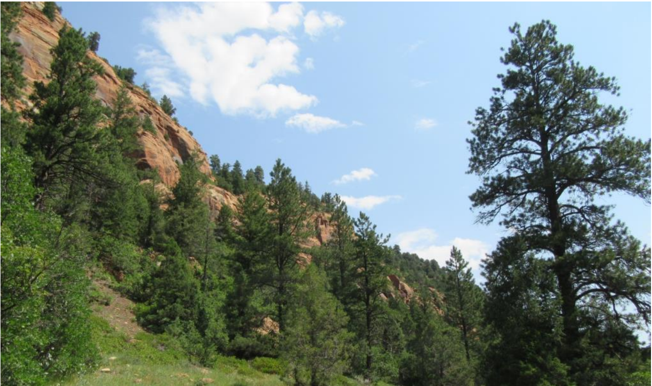
Red cliffs, green grass & trees, blue sky – the best parts of living in Western Colorado – makes the spirit soar.