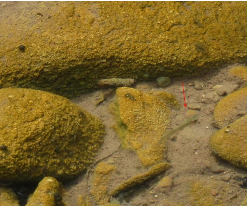
Minnow – located with red arrow.