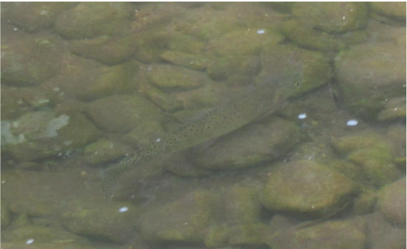
Adult cutthroat trout. Lots of fingerlings also observed.