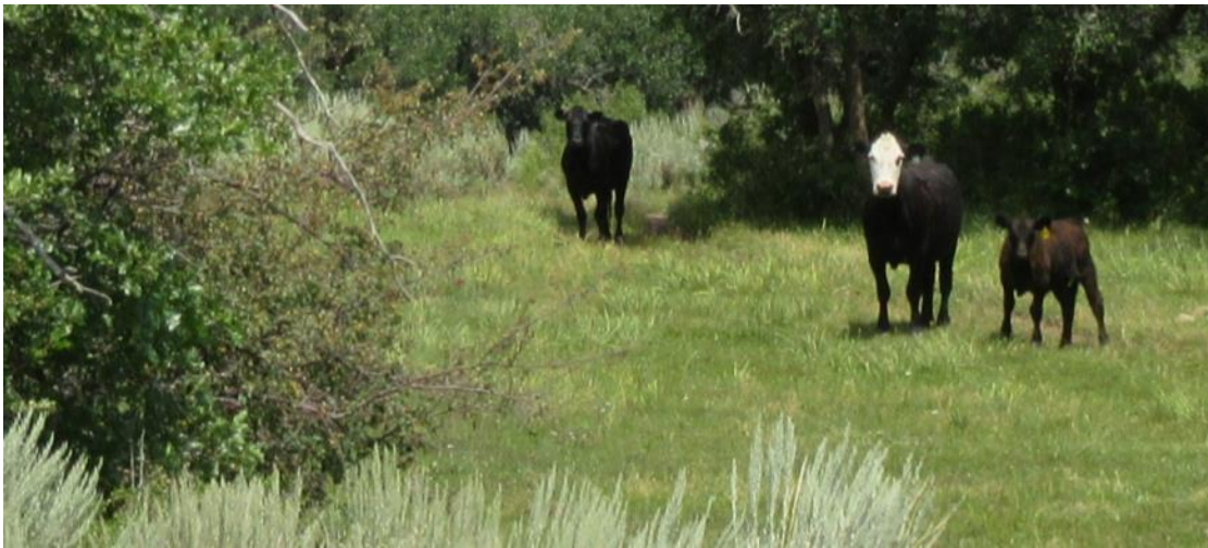
Heathy looking cattle along Short Cutoff Trail.