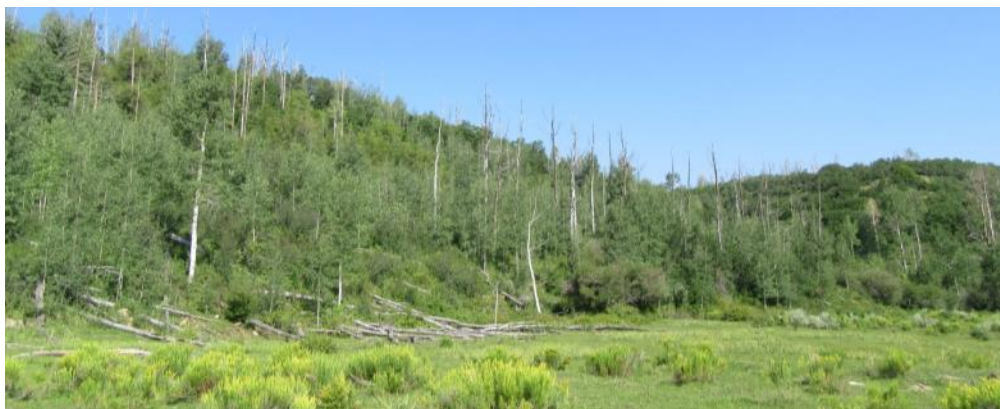
Stand of dead aspen but with lots of younger healthy aspen. 710233 4274605

Cattle: Numerous cattle along Brushy Ridge road (#409); some cattle along trail near the intersection of Short Cutoff Trail and Short Bench Trail; evidence of previous cattle visits along Short Point Trail down by North Fork Escalante Creek (they must have an easier way down than the trail we used).