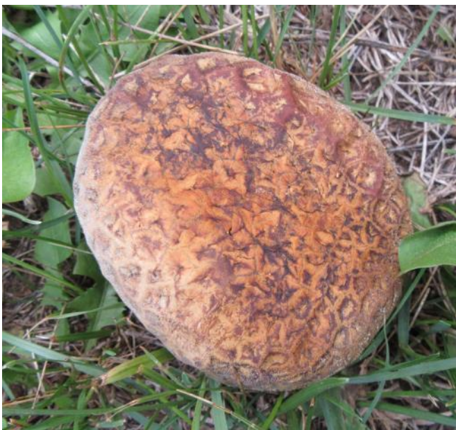
Old Giant puffball. Interesting patterns.