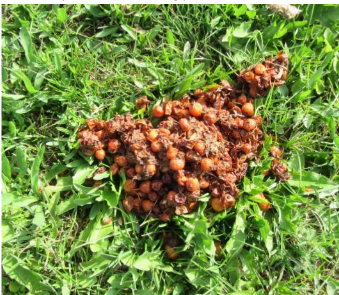
Digestion problems for bear?