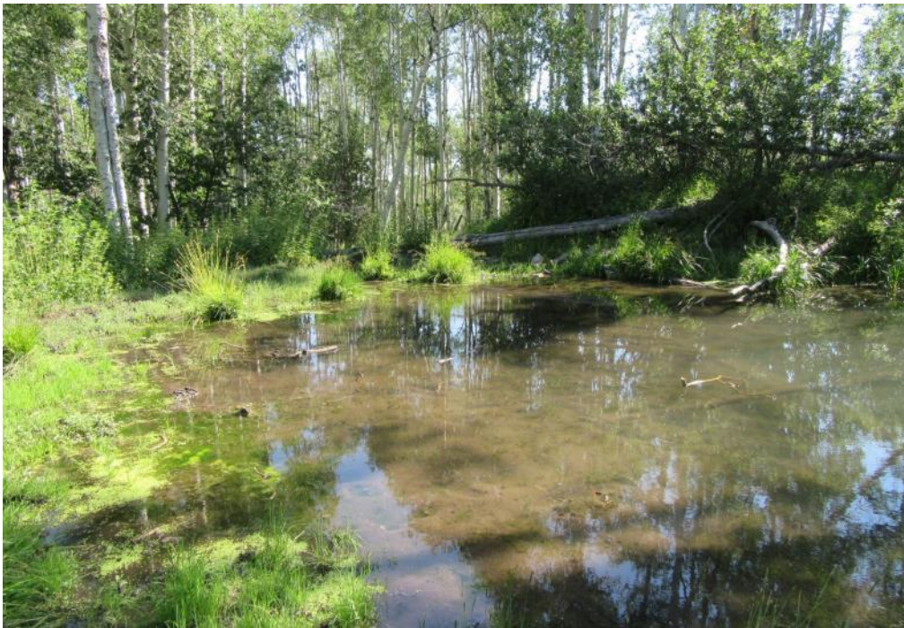
Pond 2. NW end. Water continuing to fill pond. Large adult or near adult salamander. 690304 mE 4303520 mN