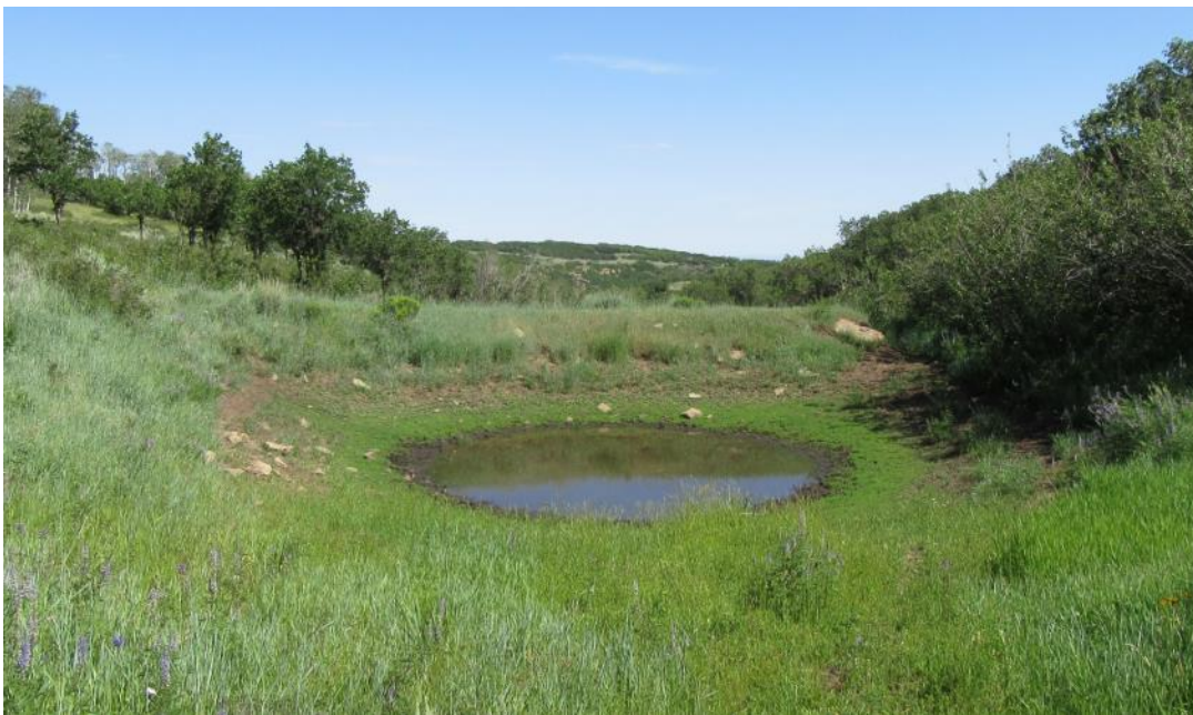
Pond 3. Very little water present. 690447 mE 4303995 mN