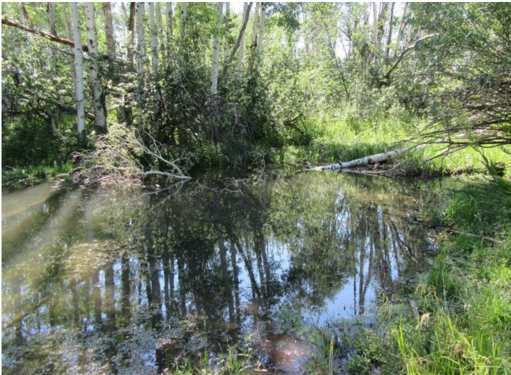
Pond 2. South east end of pond.