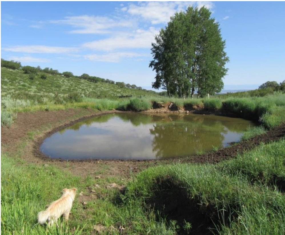
Pond 1. At: 690566 mE 4303021 mN Lots of young salamanders present.