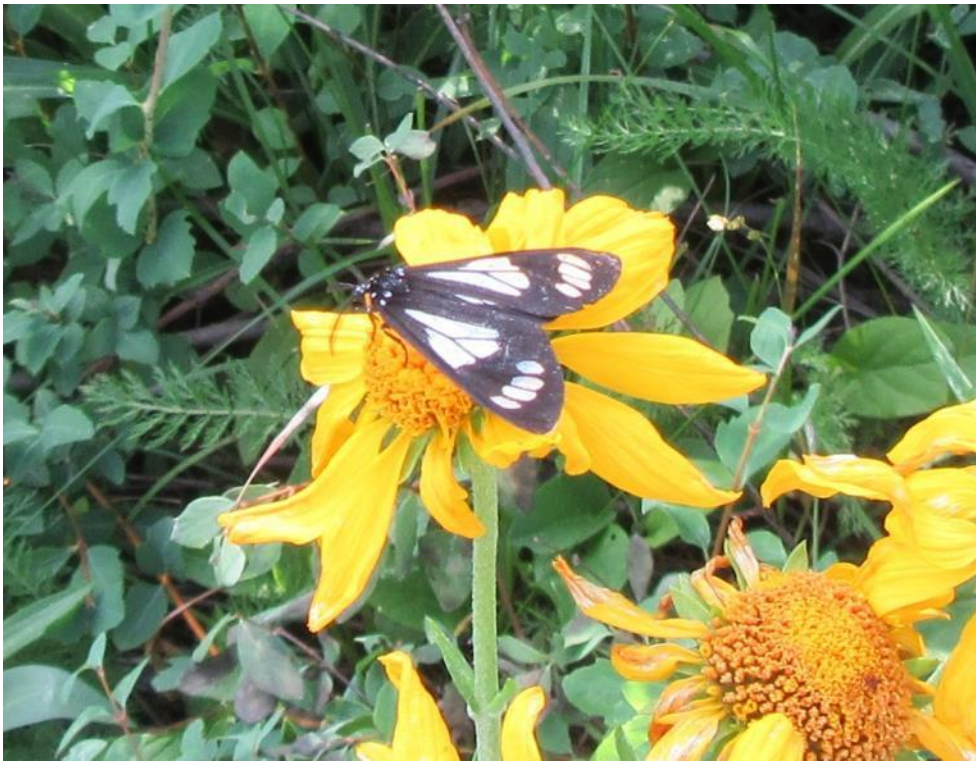
Black and White Tiger Moth (Police Car moth?)