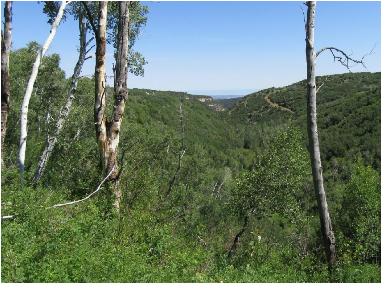
Nice view at: 690759.76 mE 4304580.55 mN