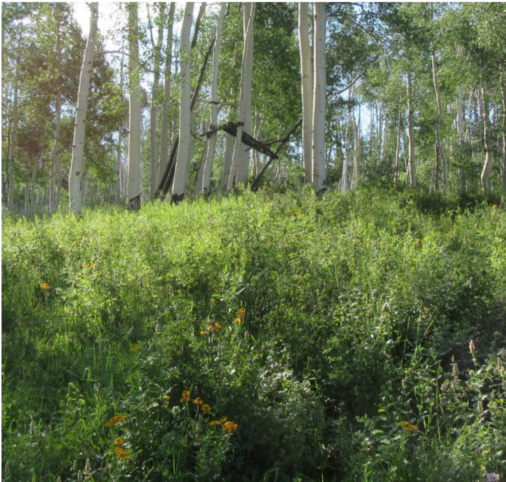
Hunting stand left in tree is falling down. 690772.05 mE 4302336.96 mN