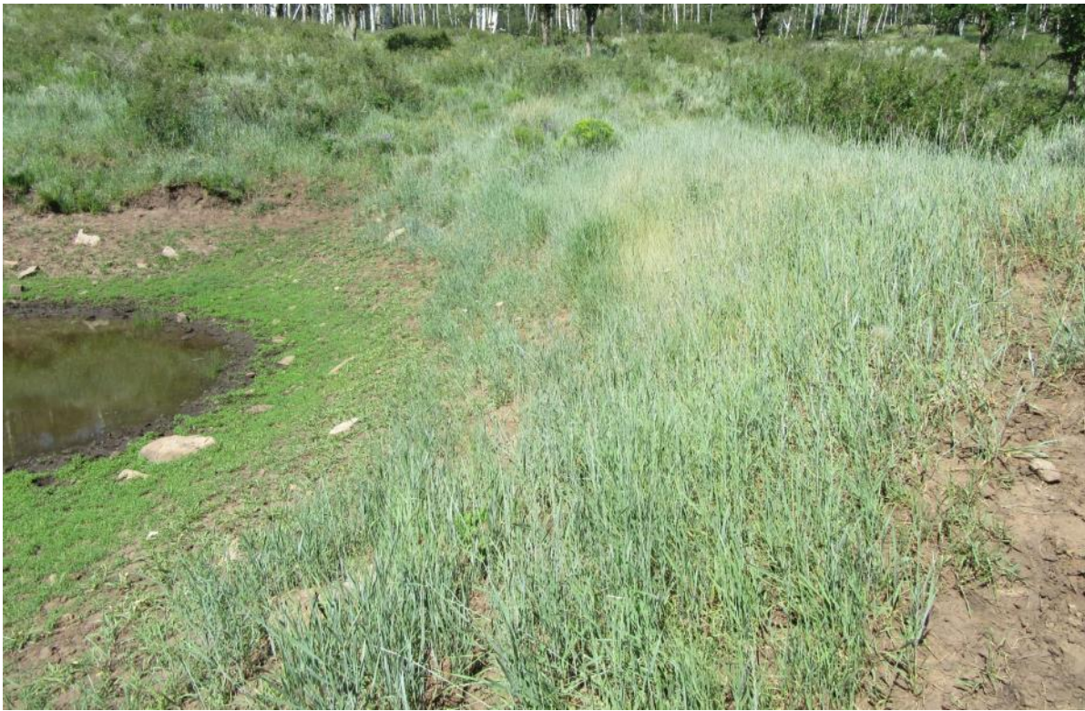
Pond 3 dam.