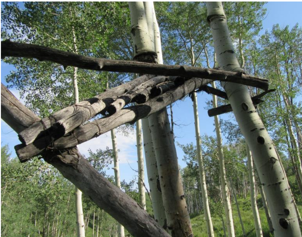
Hunting stand left attached to trees. 690772.05 mE 4302336.96 mN