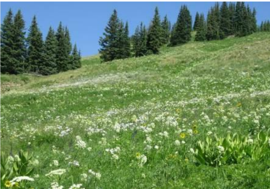
Lots of wildflowers, especially columbine.