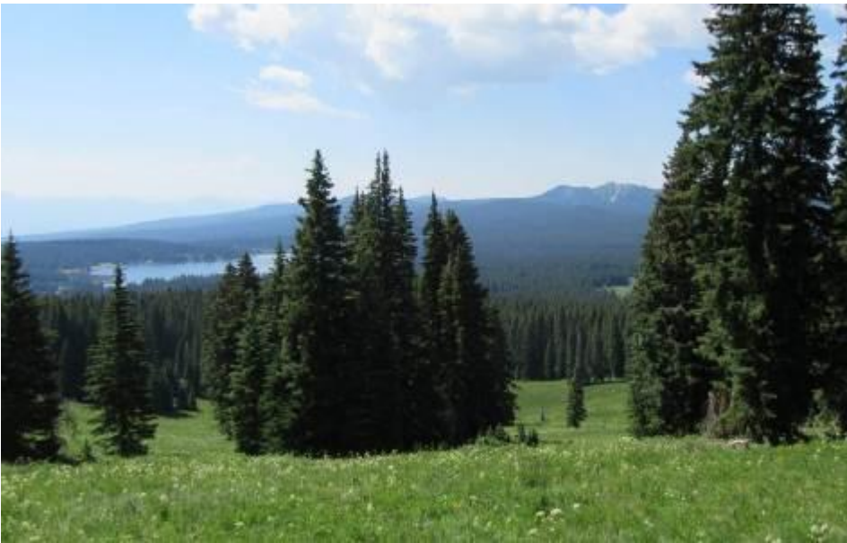
Looking out at Overland Reservoir and Crater Peak.