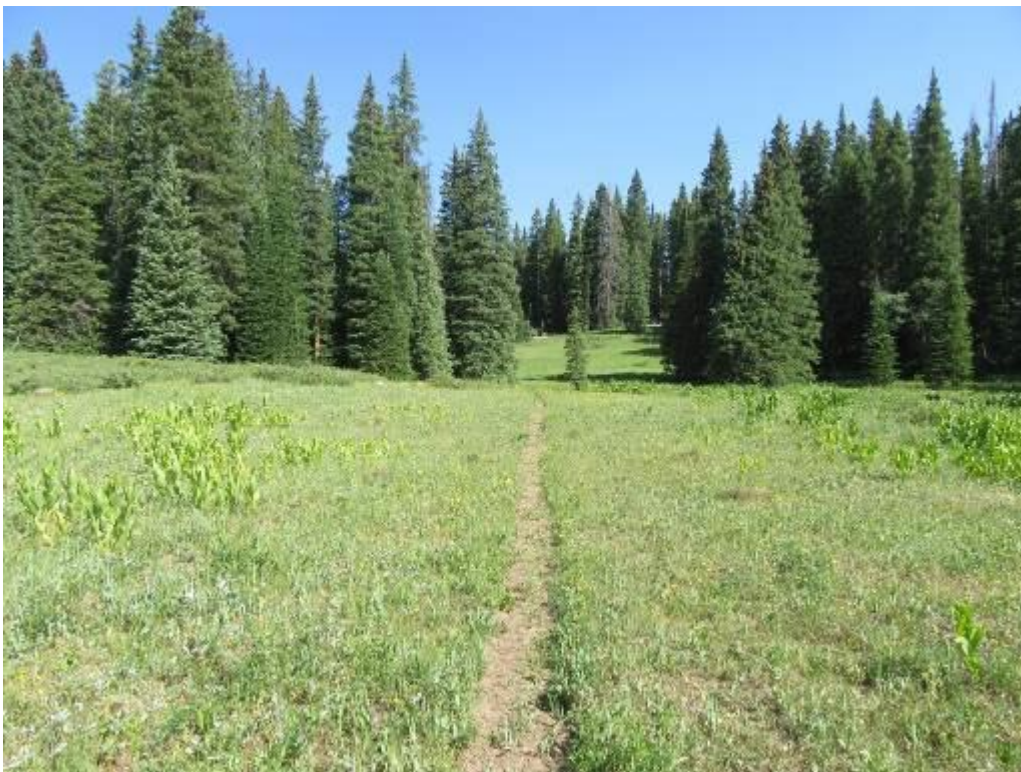
The trail is quite clear in places and goes through some nice meadows.