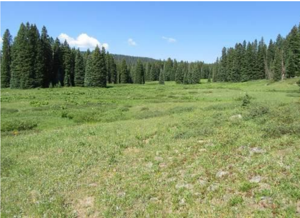
Another nice meadow.