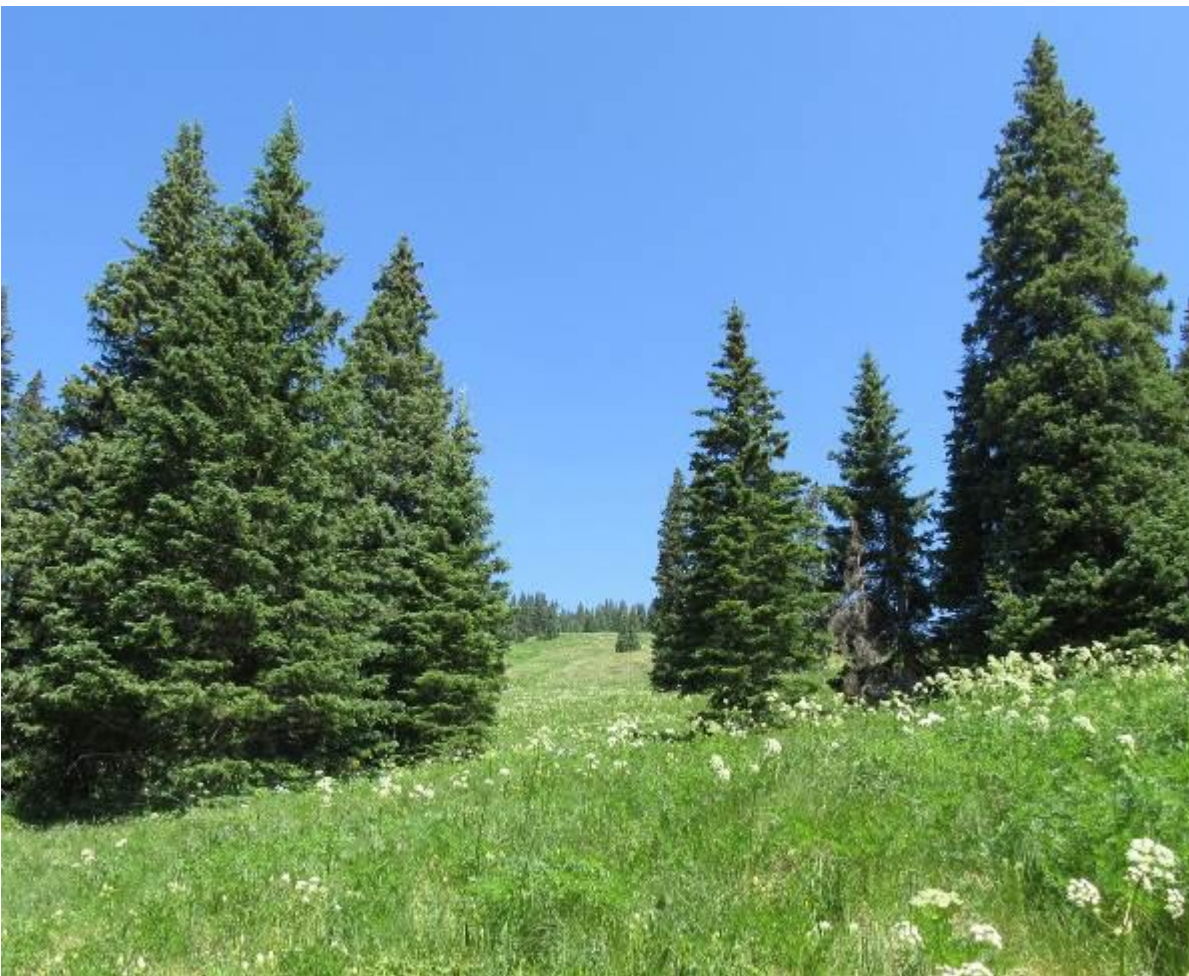
On the slope of Chalk Mountain.