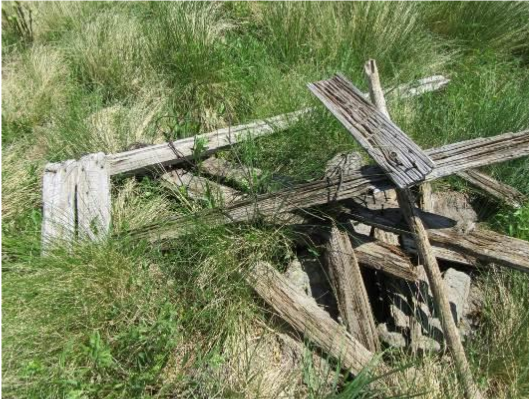
Remains of structure on summit of Chalk Mountain. Historic?