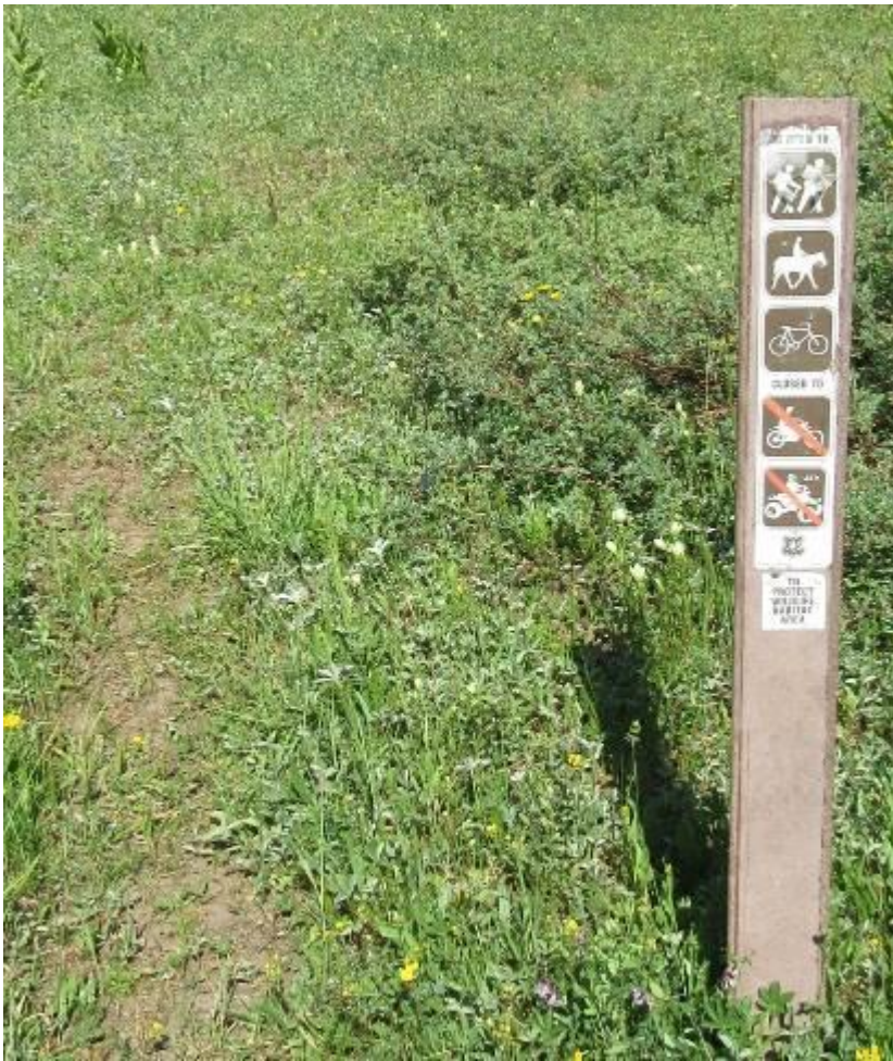
Post at the start of the livestock/game trail. The sticker at the bottom says "To Protect Wildlife Habitat Area".