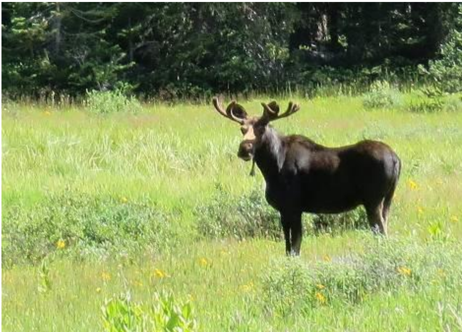
Moose near Crater Lake 7/2015