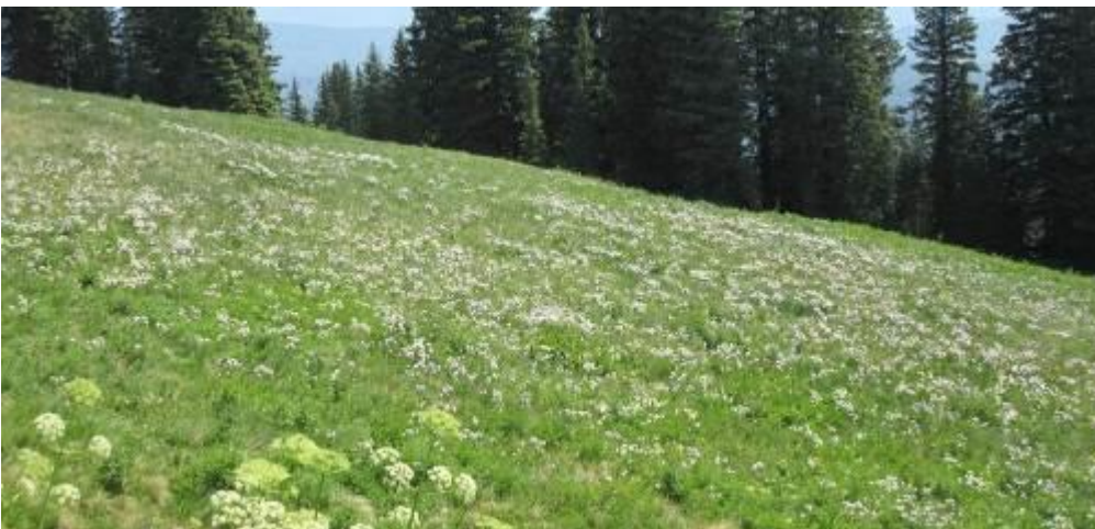
A sea of columbine.