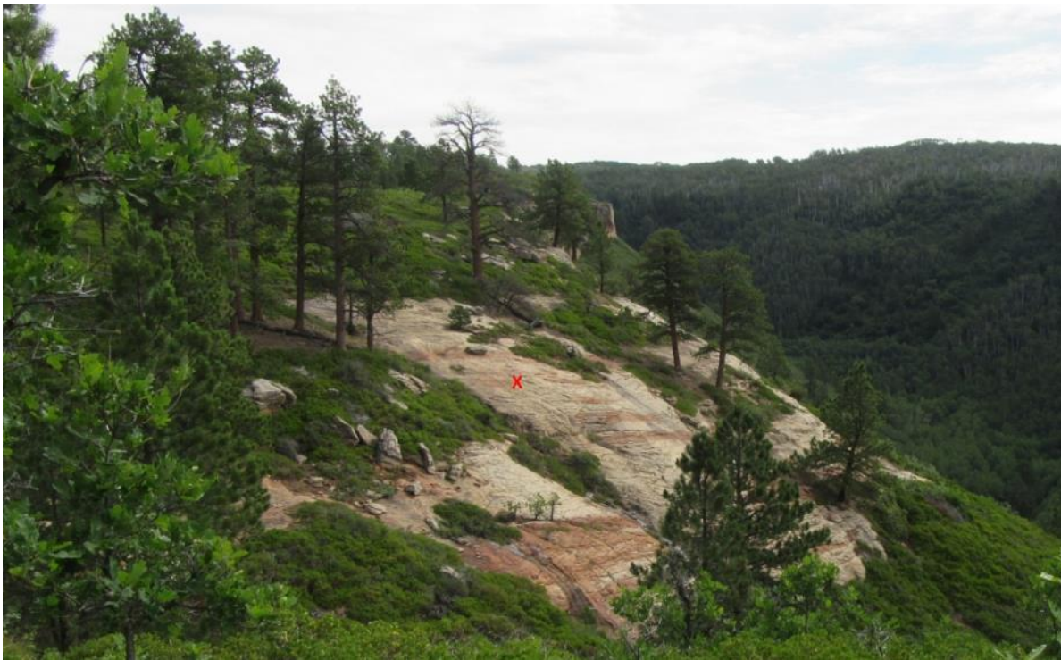
Looking back at view point. Hiker was standing at approximately the red X.