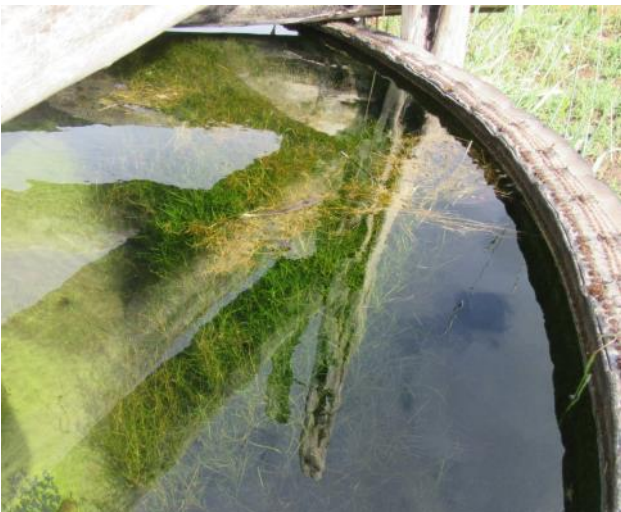
Vegetation starting to thicken in trough at spring.