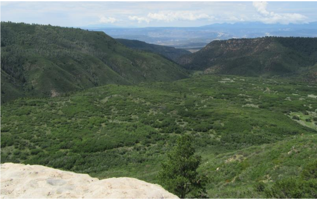
View from lunch spot looking into Blue Creek Canyon. La Sals are in the clouds.