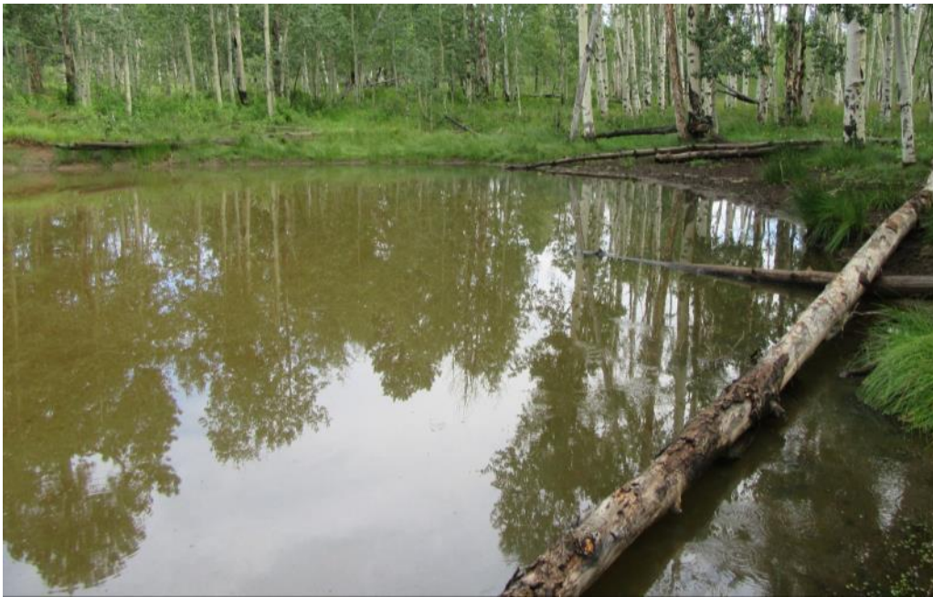
Pond (1) at 699336 4279480 dir: N