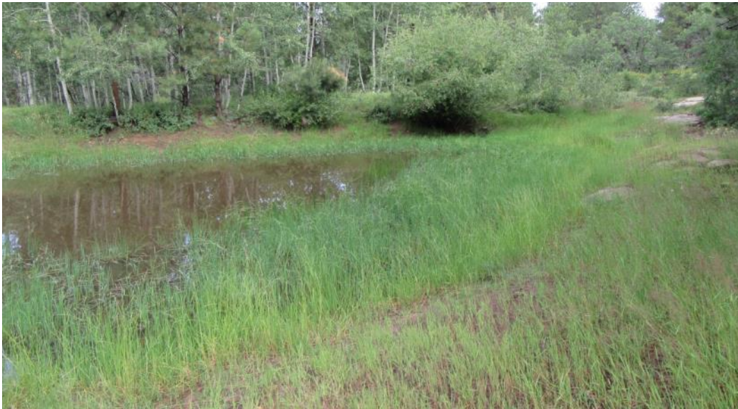
Pond (2) more vegetation growing in pond but still lots of water. At: 698992 4279033 dir: NW