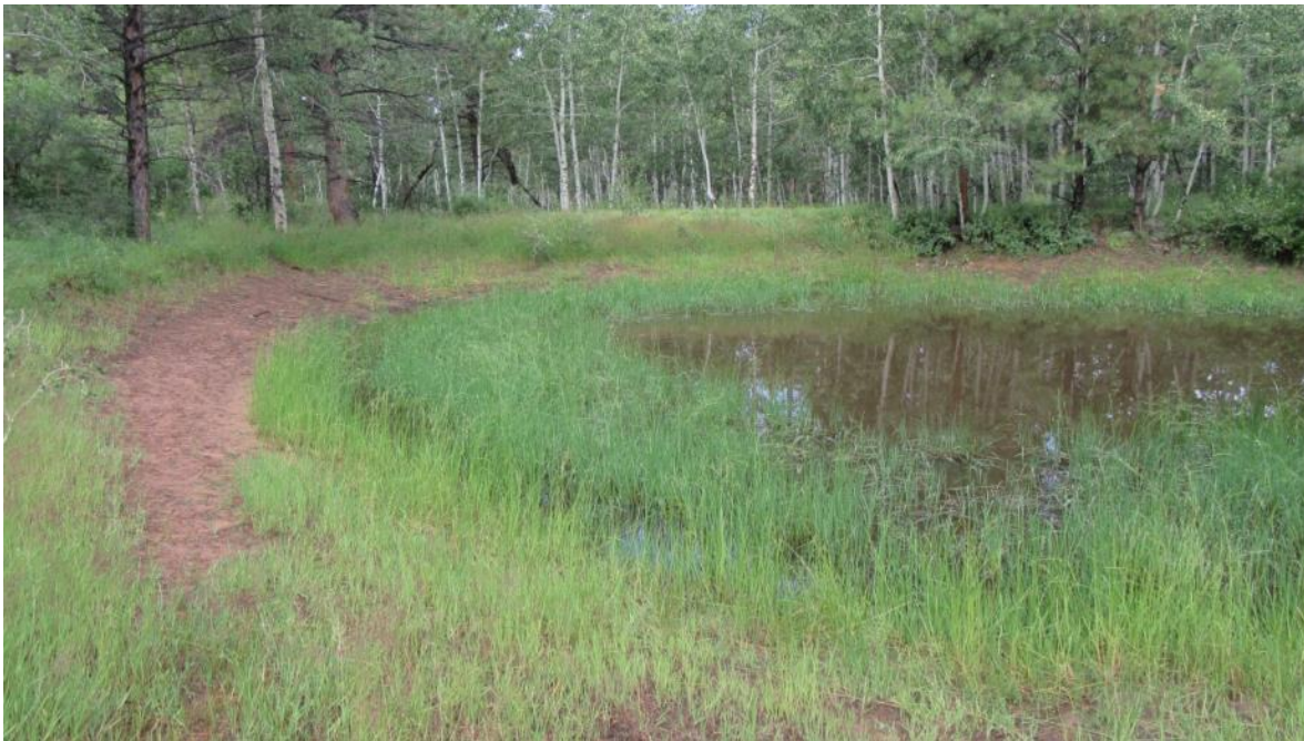
Pond (2) 698992 4279033 dir: W