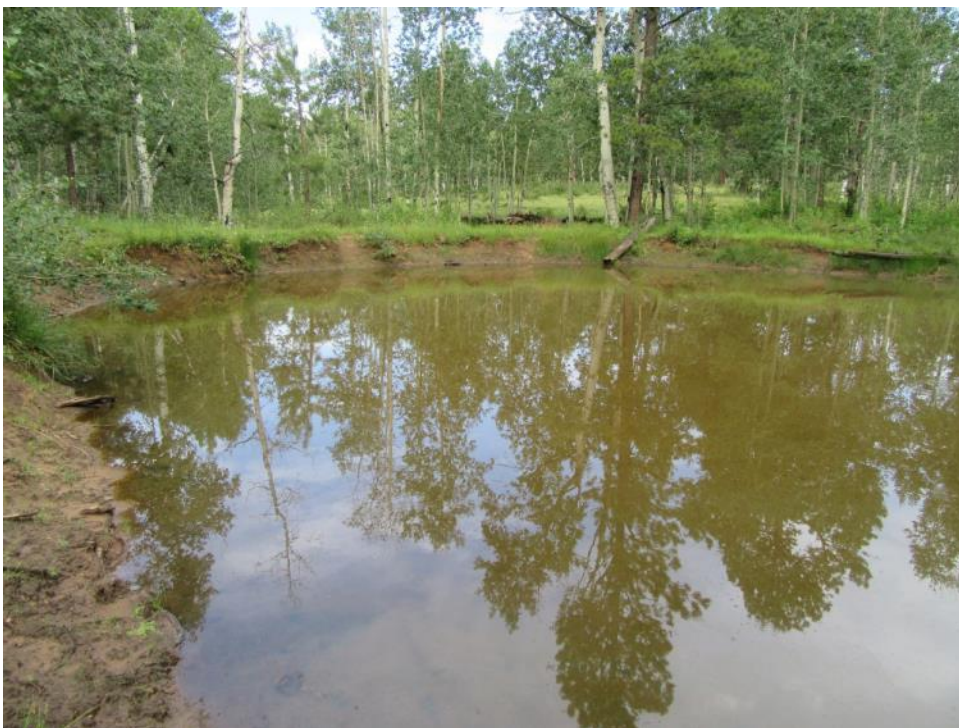
Pond (1) at 699336 4279480 Dir: W