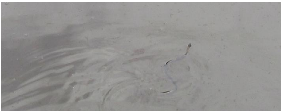
Snake crossing pond (1).