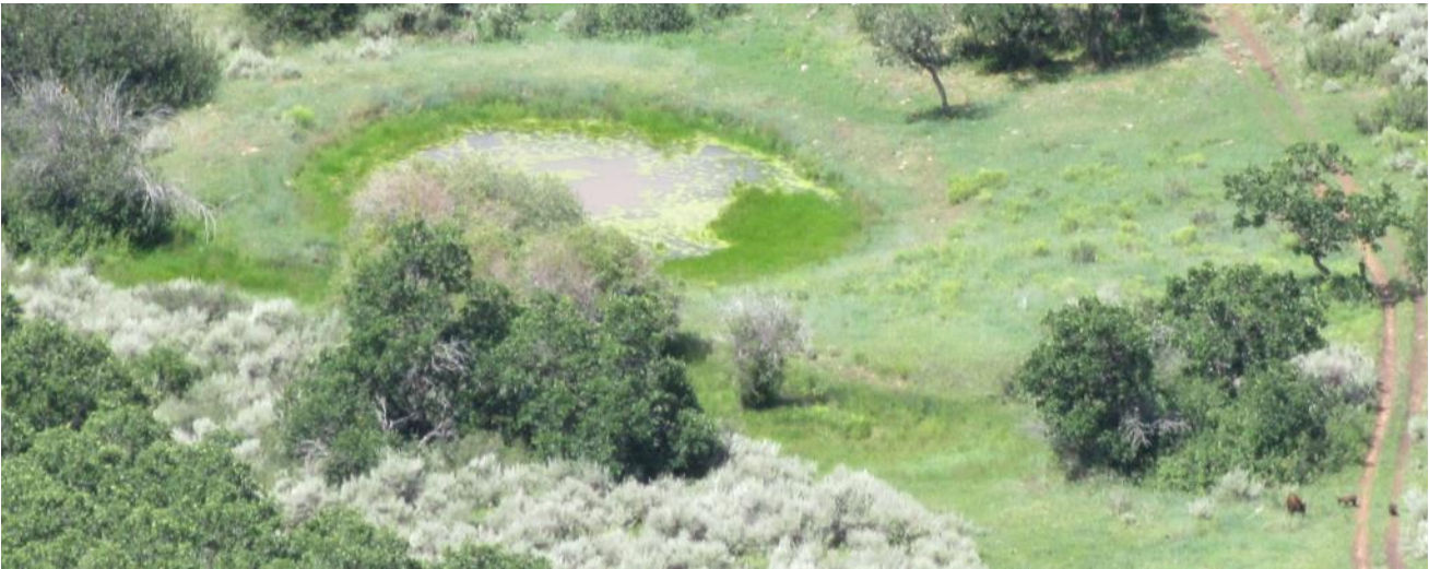
Pond (3) viewed from mesa rim. Bears in bottom right corner of photo. Pond at: 697614 4277117