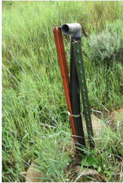
Top is disintegrating or being chewed on. 700837 4279928 Pipe is in good condition and well protected.