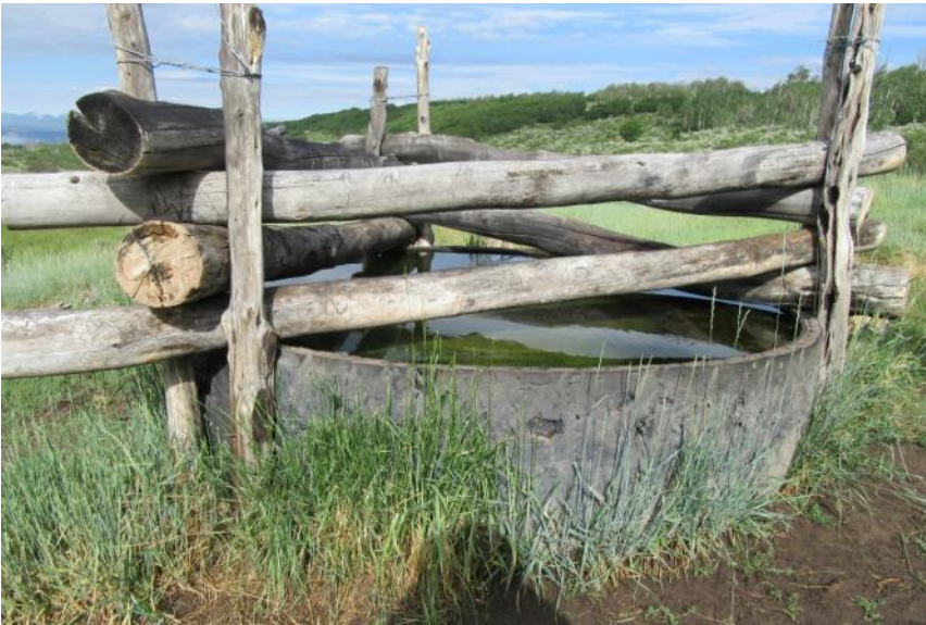
Trough in good shape and holding water. At: 700733 4279948