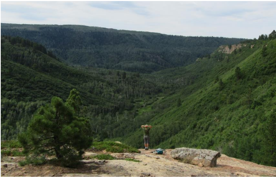
View looking into Mailbox Branch canyon from spot that is best approached on foot. 699070 4278709 dir:S